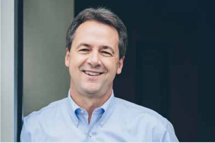
While not a resident of Big Sky, Montana Gov. Steve Bullock worked day and night throughout the year to make sure that Montana communities, of all sizes, received resources necessary to survive a challenging year.