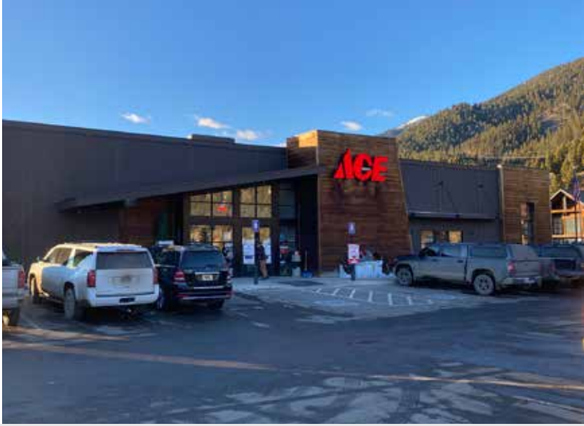
Ace Hardware has been a Big Sky staple, from its small location on U.S. Highway 191 to its upgrade along Lone Mountain Trail. Despite pandemic challenges, ACE has remained open and helpful to the community throughout 2020.