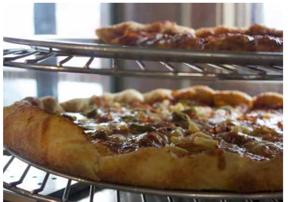
The pizza lunch special is just one of the many affordable and delicious options at the Blue Moon Bakery.