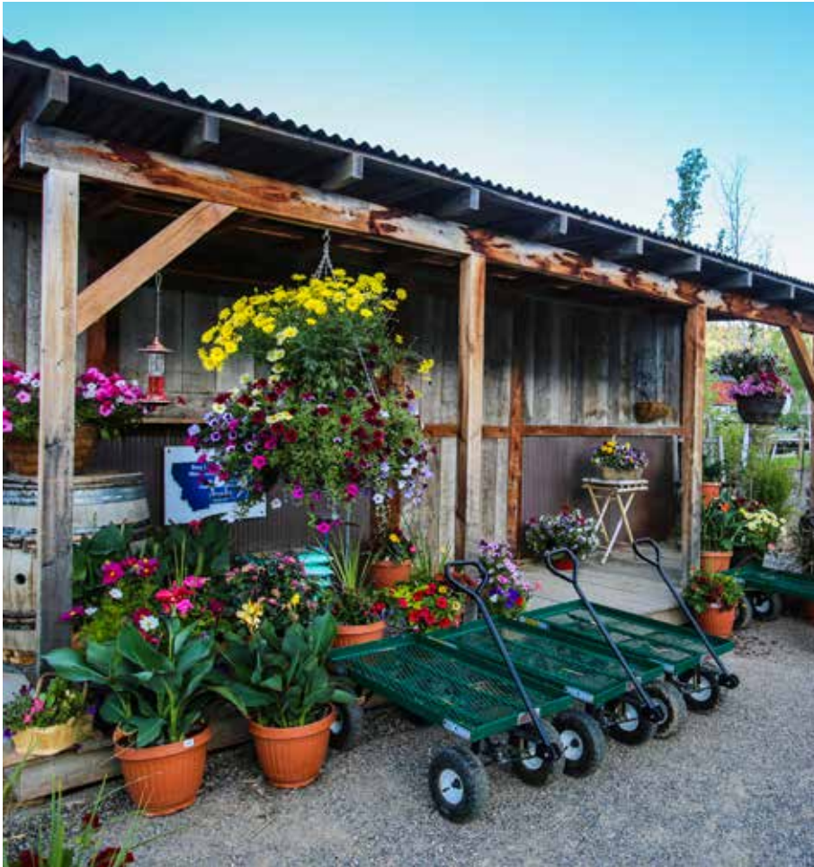
Big Sky Landscaping had a humble beginning in the early 2000s but now has 50 employees, a landscaping operation and a retail garden center.