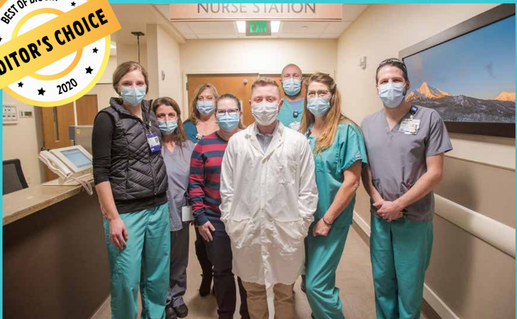
COMMUNITY MEMBER OF THE YEAR