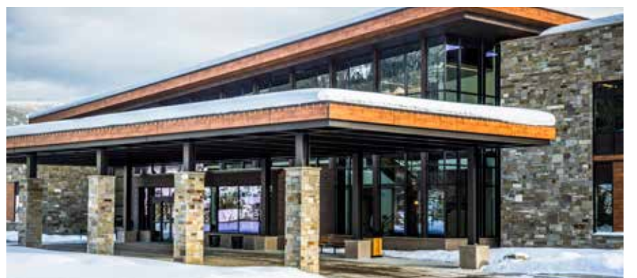
The Big Sky Medical Center acquired supplies, technology and additional beds in order to prepare for the virus’ spread in the community.

Conceived with the very purpose of supporting the Big Sky community during a time of unprecedented challenge, Big Sky Relief was formed in rapid response to the pandemic by Big Sky Resort Area District and the Yellowstone Club, Spanish Peaks and Moonlight community foundations.