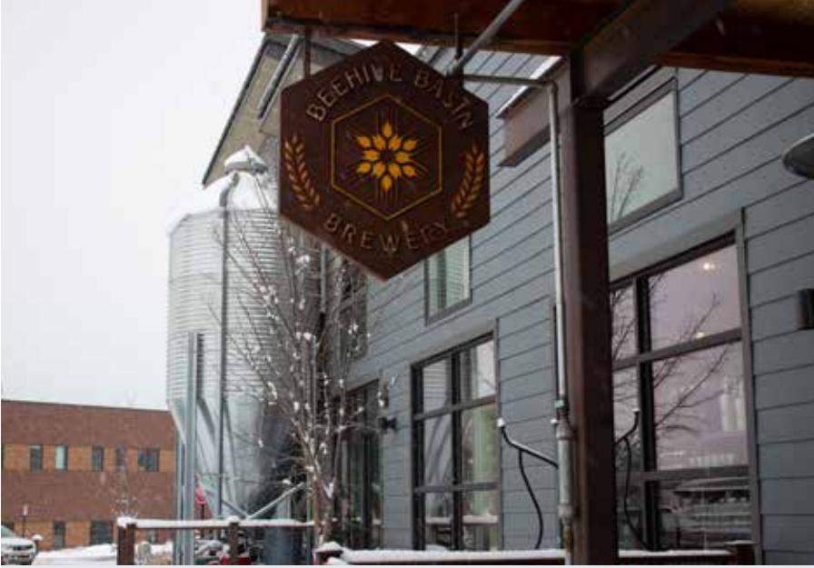
Beehive Basin Brewery, voted Best Bar, is conveniently located in Town Center and offers a roster of some of Big Sky's most stellar brews.