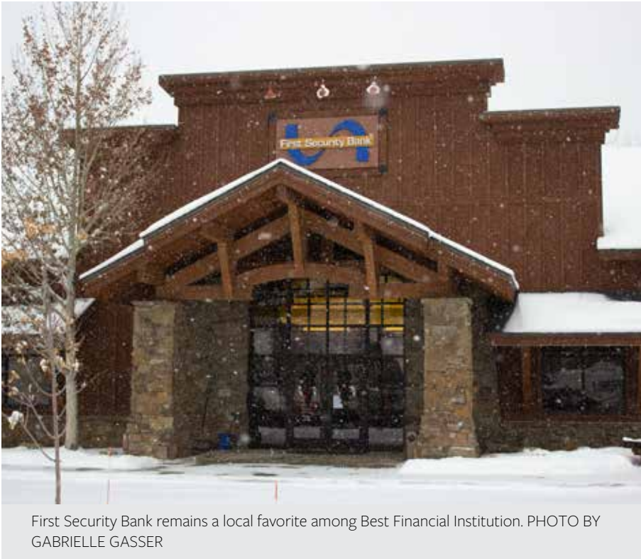
First Security Bank remains a local favorite among Best Financial Institution.