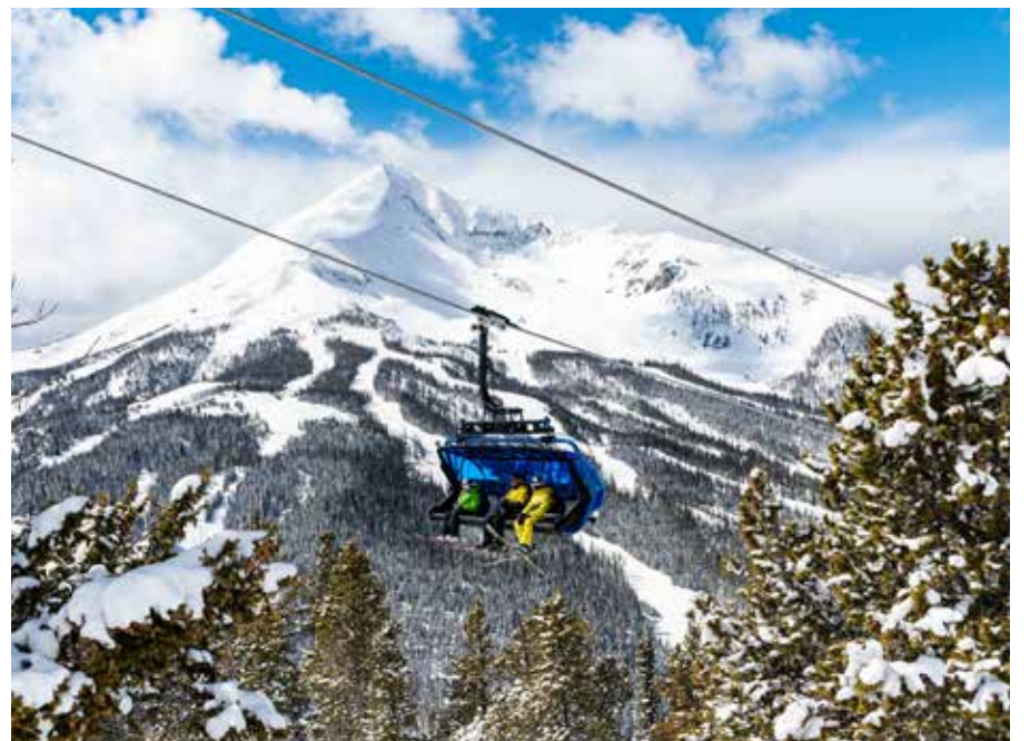
The resort offers 5,850 skiable acres as well as a wide variety of activities for every season.