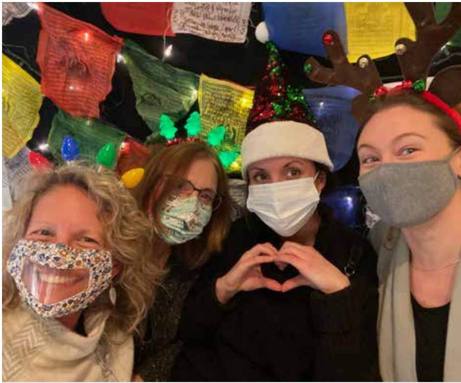
Santosha Wellness Center was founded by Callie Stolz in 2012.