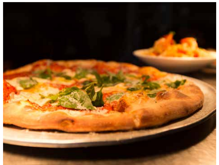
High- quality locally sourced ingredients elevate Ousel and Spur’s gourmet pizzas.

Kettleridge also offered a big shoutout to her staff. “We might have the best pizza, but we definitely have the best staff.” ouselandspurpizza.com