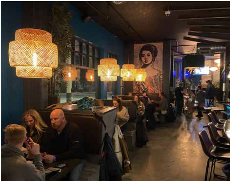
The Best Restaurant in Big Sky serves up quality sushi and an authentic dining experience.