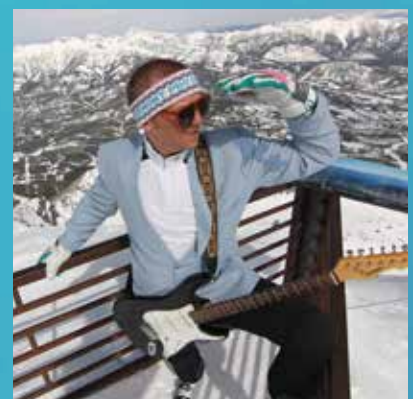
COVID MPV