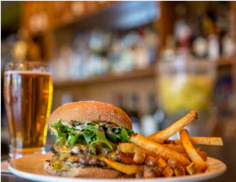
The bywom burger continues to reign supreme in Big Sky, with all the fixings of your favorite burger loaded up with the bistro's secret sauce.