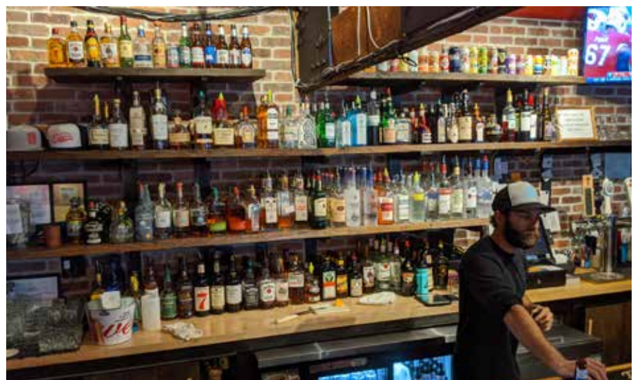
Scissorbills Saloon has been an après favorite for boarders and skiers alike for decades.