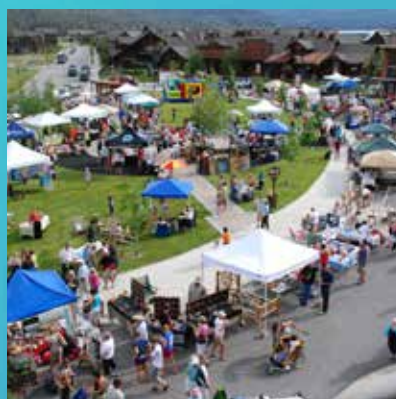
BEST ANNUAL EVENT