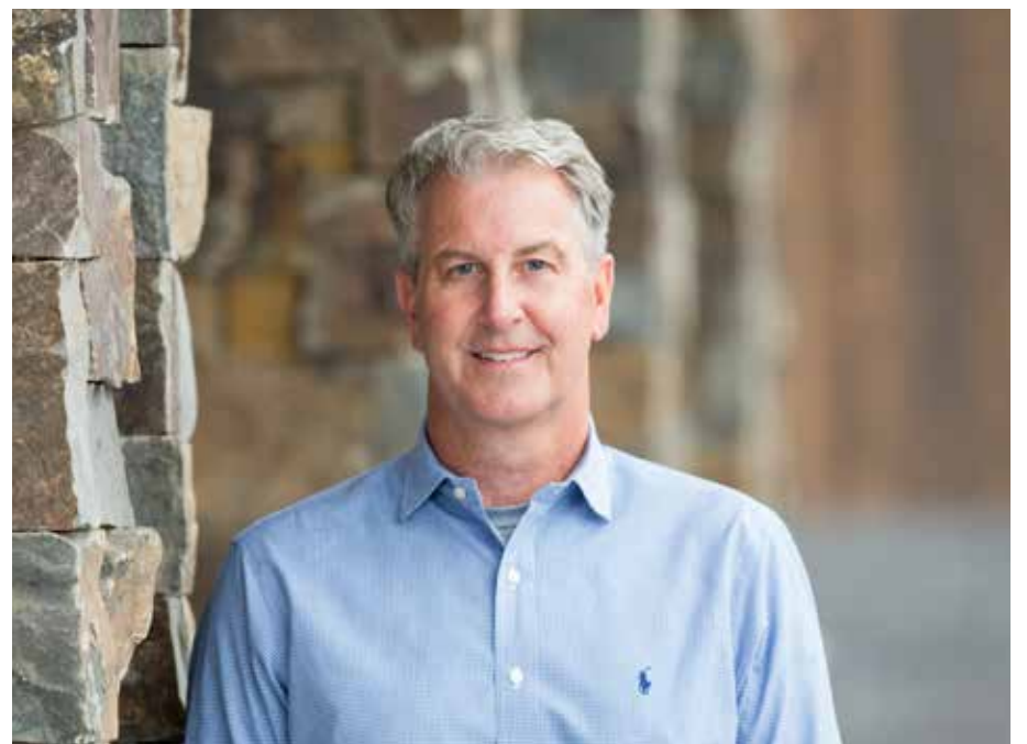
For 16 years Centre Sky Architecture has been crafting custom residential, ranch, resort and commercial architecture across the Rocky Mountain West.