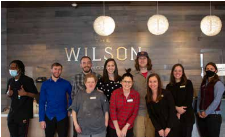
The Wilson Hotel has been operating in Big Sky for two years and provides a gathering place for the community.