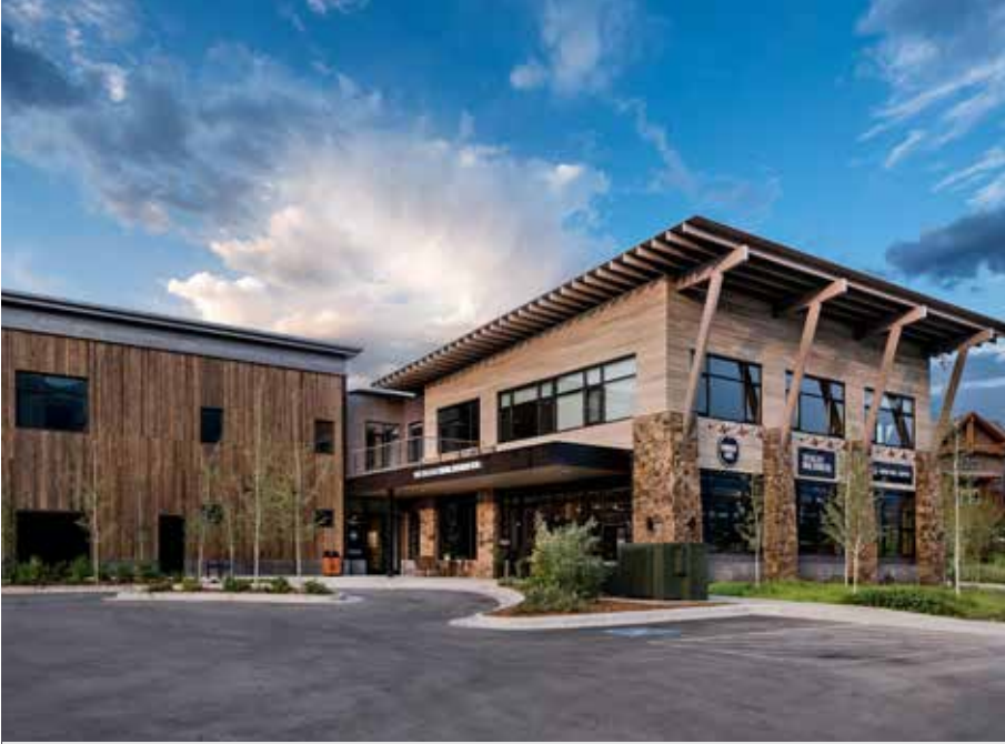
Currently representing one of every three real estate listings in Big Sky, Big Sky Real Estate Company is a stand-out firm in the competitive Big Sky market.