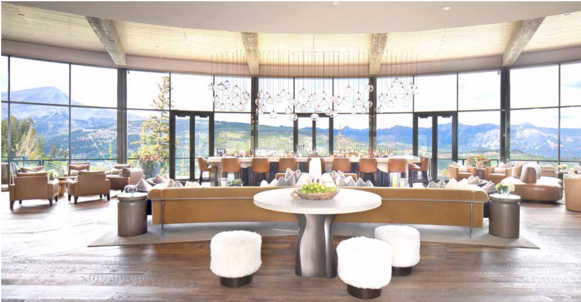
Yellowstone Club Golf Course Clubhouse

Three Big Sky clubs, unlimited possibilities.