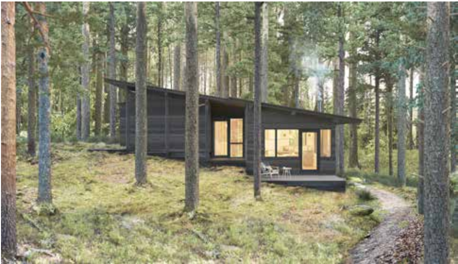
Lake Cabin in Moonlight Basin

luxury. Amenities include a Weiskopf-designed 18-hole golf course, a fish camp along the Gallatin River, an intimate clubhouse with direct views of the Spanish Peaks, a full-time activities team, a children’s play cabin, a wide-range of real estate opportunities and more.