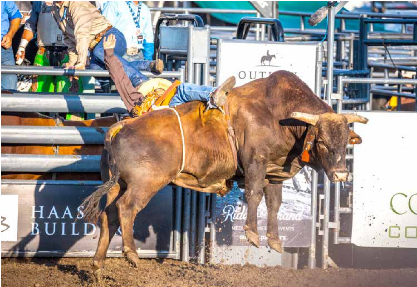
Bull riding is a high stakes undertaking. Every year the Rider Relief Fund helps 20 to 40 bull riders and bull fighters pay medical bills, negotiate medical expenses and regain financial stability after an accident.

On average, the Rider Relief Fund helps anywhere from 20 to 40 injured riders pay medical bills, negotiate medical expenses and regain financial stability every year. Athletes of all levels and ages are eligible to apply for assistance from RRF as long as they were