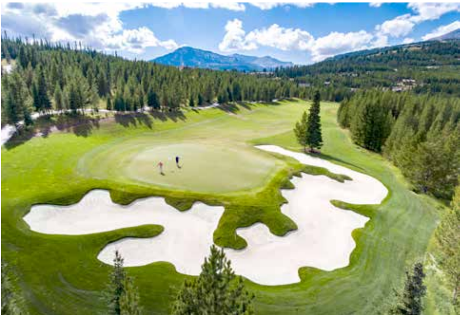
Spanish Peaks Mountain Club golf course

Spanish Peaks Mountain Club is a home-away-from home for its members. It’s a place to relax, rejuvenate and embrace the outdoors in the height of