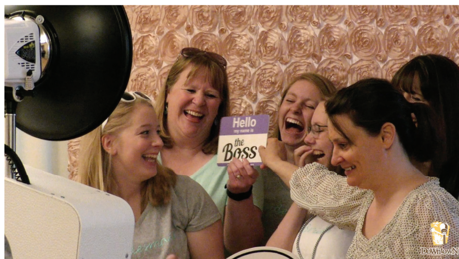
The Bozeman Bridal Walk is both a fun day to spend with friends and a practical way to connect with all the resources you need to plan your big day.

The ninth annual Photography Contest—always a highlight of the bridal walk—will take place at the Rialto Bozeman this year. Wedding photography by local and regional photographers will be on display, and ballots on hand for strollers to vote for “best bridal image,” “the most unique image,” and “best overall image.” Awards, plaques and prizes will be presented to the winning photographers. Not only is this an opportunity to support Montana artists, but also to find and connect with the perfect photographer to capture your unique wedding vision.