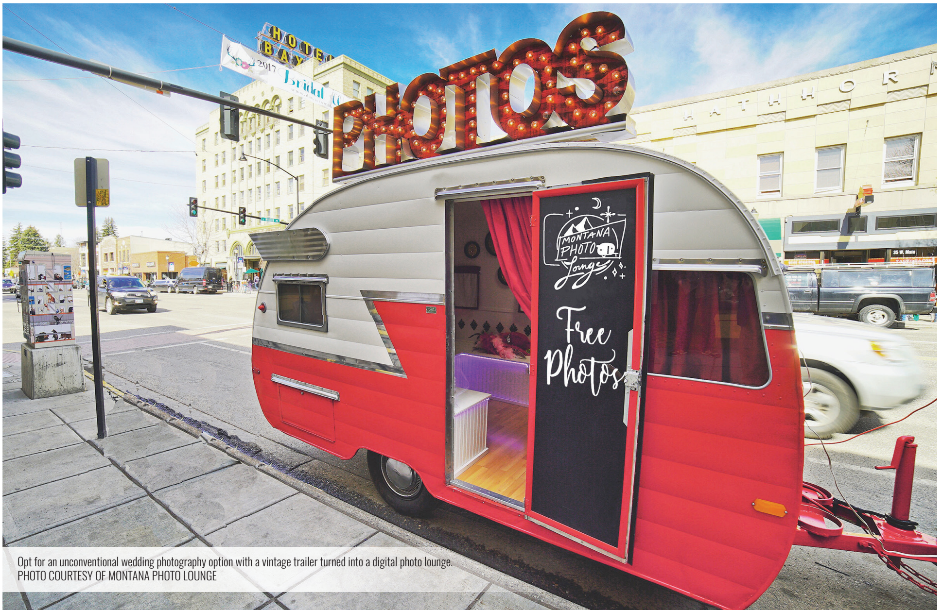
Opt for an unconventional wedding photography option with a vintage trailer turned into a digital photo lounge.